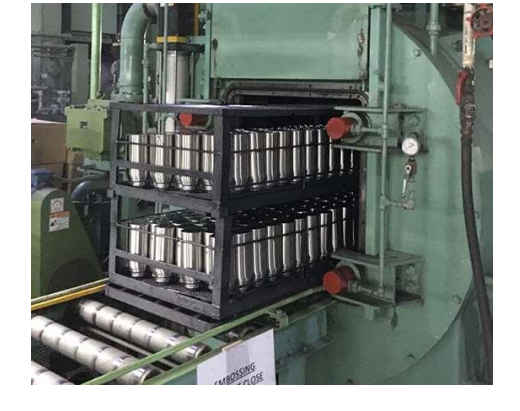
Figure 1: Large vacuum chamber