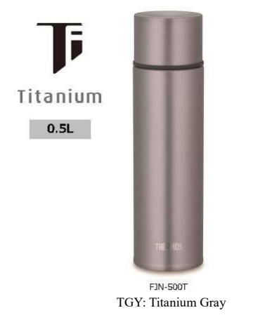
Figure 4: New product FJN-500T

Vacuum bottles are manufactured through a variety of processes, including pressing, drawing, welding, vacuum sealing, and painting. We will continue to develop more optimal manufacturing methods, not permanently depending on the existing manufacturing methods.